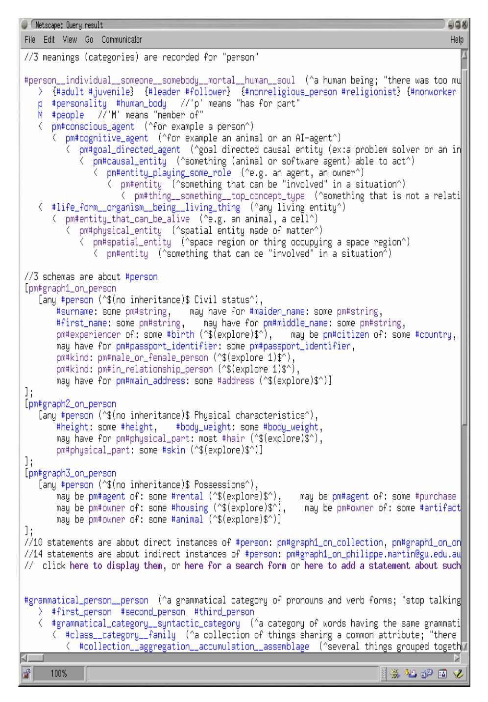
Fig. 3. Result of the previous query (Fig. 2).